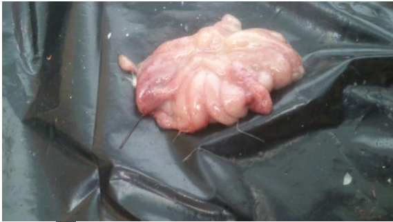
Fig. 1. Hypertrophy and congestion in Bursa of Fabricius prepared from dead birds challenged with ZMT-101 strain in control group at 6 and 8 days post challenge.

days post challenge in lung (Fig. 2). At 6 and 8 days post challenge, changes in the bursa consisted of lymphocyte depletion were observed (Fig. 3).