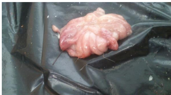
Fig. 1. Hypertrophy and congestion in Bursa of Fabricius prepared from dead birds challenged with ZMT-101 strain in control group at 6 and 8 days post challenge.

days post challenge in lung (Fig. 2). At 6 and 8 days post challenge, changes in the bursa consisted of lymphocyte depletion were observed (Fig. 3).