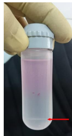
Fig. 2. Ultracentrifugation tube and the band of whole virions of the human reovirus.

Purification of the human reovirus. After ultracentrifugation of the cells lysate, a separated grey band including whole virions was visible in the CsCl gradient solution (Figure 2). The virus band was collected by top aspiration into a 100KDa Amicon Filter unit. After three washes with stabilization buffer, glycerol (final concentration of 15%) was added to the purified human reovirus and then aliquoted and kept at -70°C.