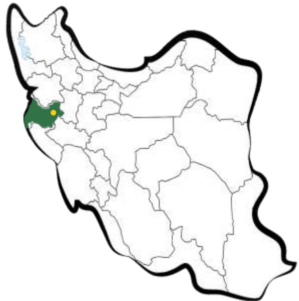
Fig 1. Map of Iran and the location of the epidemiological unit sampled (26).

This study was carried out in a goat breeding flock in one of the west province of Iran (Figure 1), 249 blood samples were taken in tubes containing K2 from 86 heads of Saanen, 80 heads Alpine and 83 heads Indigenous goat breeds, and the age, gender, clinical symptoms for arthritis, mastitis, and encephalitis of each goat was recorded.