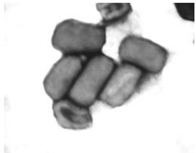
Fig. 1. TEM Electron micrographes of occlusion bodies (OBs) of CpGV and the nucleocapsid inside granulin, stained with PTA 2% aqueous, (Original, X12,000).

the acceptance of the similarity of the lines, the LC50 was nearly half of others and 0.6 of the Mexican isolate, however, that was not significant. The calculated LC50 value for the Mexican isolate in the present experiment was 2724 OB/ml, comparable with 2600 OB/ml (7). The slopes of probit lines were promising and had no significant difference, but the similarity hypothesis of probit lines rejected. However, considerable differences in the virulence and biological activity of the isolates of the CpGV isolates for neonate C. pomonella larvae were found (Table 1) is hopefulness.