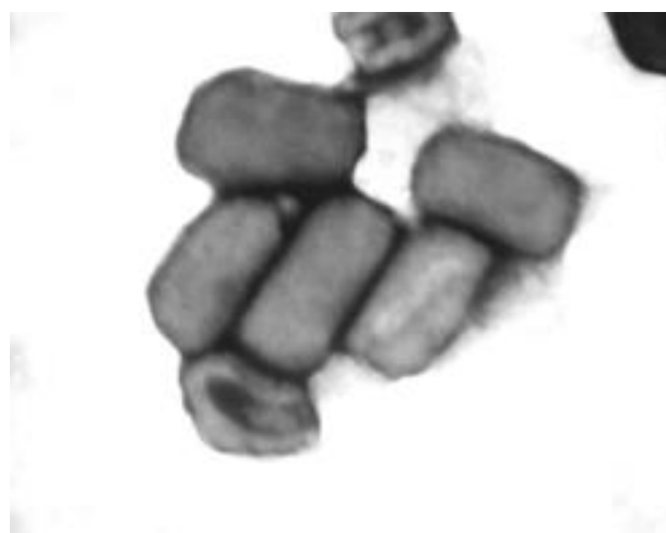
Fig. 1. TEM Electron micrographes of occlusion bodies (OBs) of CpGV and the nucleocapsid inside granulin, stained with PTA 2% aqueous, (Original, X12,000).

the acceptance of the similarity of the lines, the LC50 was nearly half of others and 0.6 of the Mexican isolate, however, that was not significant. The calculated LC50 value for the Mexican isolate in the present experiment was 2724 OB/ml, comparable with 2600 OB/ml (7). The slopes of probit lines were promising and had no significant difference, but the similarity hypothesis of probit lines rejected. However, considerable differences in the virulence and biological activity of the isolates of the CpGV isolates for neonate C. pomonella larvae were found (Table 1) is hopefulness.