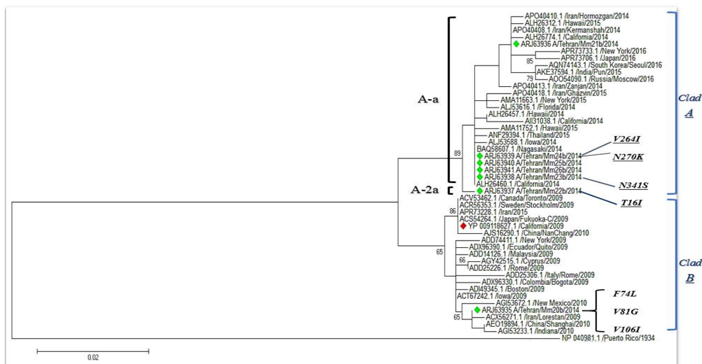
Fig. 3. Phylogenetic tree of the neuraminidase (NA) gene segment 6 of influenza A(H1N1) viruses at the protein level. Phylogenetic tree constructed on the basis of the NA H1N1 influenza viruses collected in Iran from 2014 to 2015. The trees were constructed using the maximum likelihood (ML) method with bootstrap analysis of 1,000 replicates. The NAs sequences of Iran H1N1 isolates were compared with relevant virus sequences available in GenBank. sequences from representative influenza A(H1N1) isolates from Iran and closest blast hits from different regions of the world. Sequence from vaccine strains (NC_026434.1 /California/2009) were also included. Iranian's samples virus isolated are displayed by green signs.