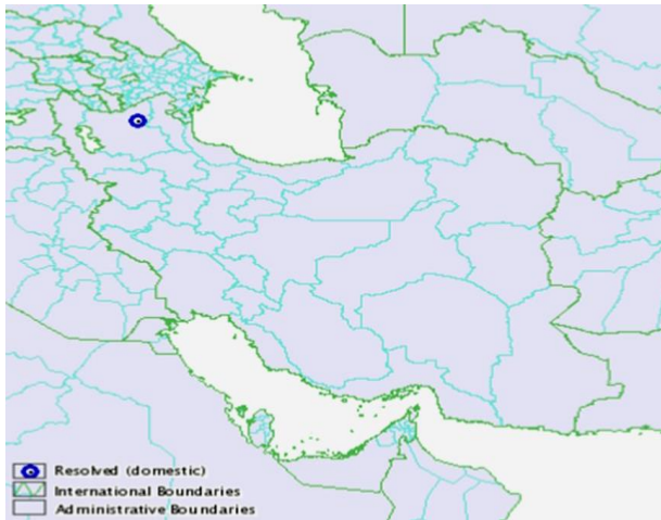
Fig. 1. The location of outbreaks in Iran