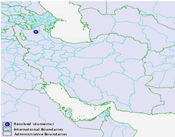
Fig. 1. The location of outbreaks in Iran