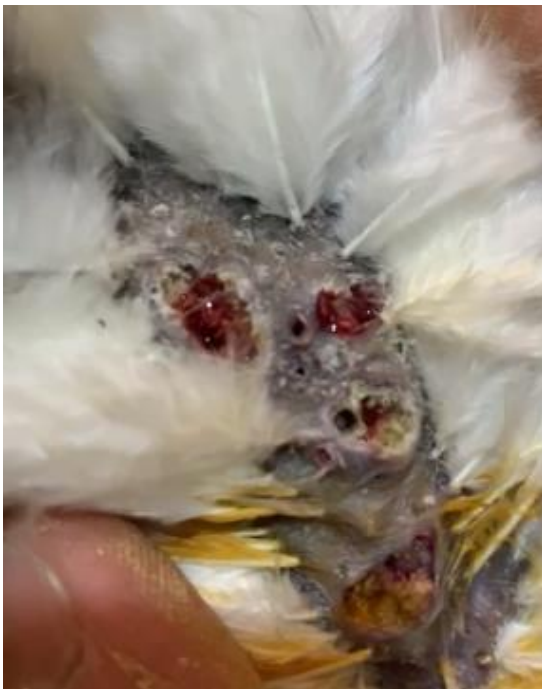
Fig 1. Pox lesions in the posterior dorsal area of a nine month old Silkie hen.

PCR parameters for amplification: initial DNA denaturation over 2 min at 94 °C followed by 35 cycles of 1 min denaturation at 94°C, 1 min annealing at 60°C, and 1 min elongation at 72°C and terminated with a final extension step at 72 °C for 2 min [8].