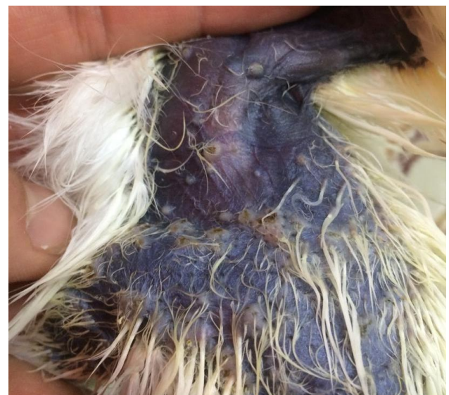
Fig 2. Pox lesions in the feathered area of a 9-month-old Silkie rooster.

An automatic sequencer (ABI-370, Applied Biosystem) and both forward and reverse primers were sequencing. Sequences were selected from isolates of countries as near as possible based on different places and times of reporting. Sequence analysis was performed by the neighbor-joining method (Tamura-Nei model) with the MEGA7 program. The robustness of the phylogenetic trees was assessed by 1,000 bootstrap replicates with values higher than 50. The FVP sequences tested in this study were deposited in GenBank under accession numbers POX 2021 UT-Vasfi.