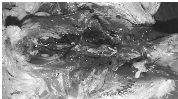
Figure 1 A 29-day old Mg+ chicken, was inoculated with a H9N2 subtype via IV & ON routes, and died 5 th PID. Pulmonary hyperemia and fibrinous cast in tracheal bifurcation are present.

Both of dead birds belonged to Mg+ chickens inoculated via both IV and ON routes or IV route alone. At the necropsy, the air sacs were cloudy and thickened. Numerous subepicardial petechial hemorrhages were present in heart. The kidneys were congested with foci of nephritis and urate deposition. The thymus was hyperemic with subcapsular petechial hemorrhages. Fibrinous cast in tracheal bifurcation and pulmonary hyperemia were observed, only in the chickens that died on 5 th PID from IV and ON routs inoculated Mg+ group (Fig.1).