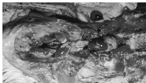
Figure 2 A 29-day old Mg+ chicken, was inoculated with a H9N2 subtype via IV route, died 7 th PID. Severe nephritis and renal urate deposition are present.

Mild to severe nephrosis and urate deposition were seen in the kidney of two dead birds (Fig.2). The carcasses were congested and severe congestion was seen in the livers. Congestion and subcapsular petechial hemorrhages were seen in the spleen and bursa of fabricious.