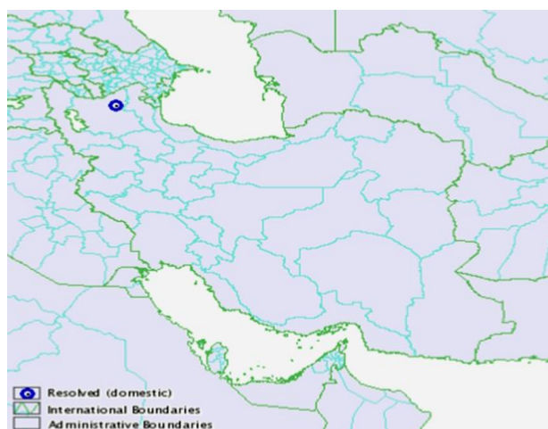
Fig. 1. The location of outbreaks in Iran