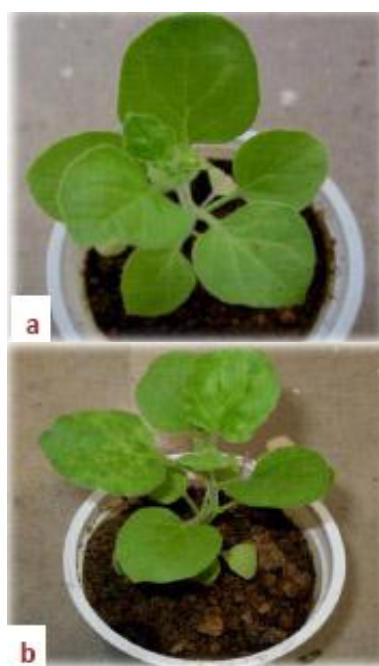
Fig. 4. PDS gene silencing in N. benthamiana by tomato PDS. a: Control plant(infiltrated using pTRV 1 and pTRV 2 without PDS gene). b: PDS gene silencing in tomato showed photobleaching in leaves.

Infiltration of tobacco plants using vectors carrying the tomato PDS gene, showed mosaic symptoms on leaves however no symptom was found on control plants (fig. 4).