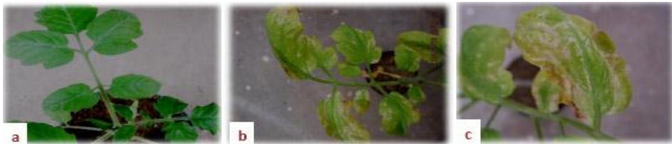
Fig. 3. PDS gene silencing in Tomato. a: Control plant(infiltrated using pTRV 1 and pTRV 2 without PDS gene). b and c: PDS gene silencing in tomato showed photobleaching in leaves.