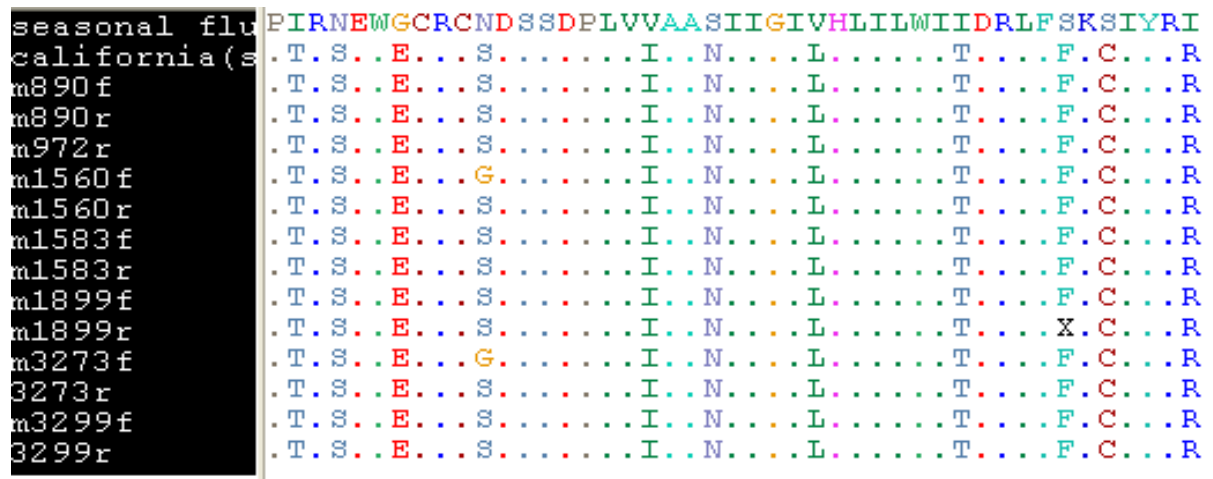
Fig. 4. 2009 pandemic influenza A amino-acid sequences.