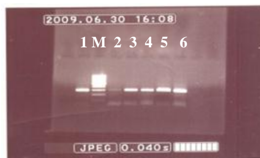
Fig. 2. Seasonal influenza A/H1N1 RT-PCR bonds. Lane 1: Positive Control, Lane M: Ladder and other lanes: Samples

In sequencing survey, none of the the 14 seasonal H1N1 viruses had mutation in the transmembrane domain of M2 gene (fig. 3). All of seven samples of 2009 pandemic