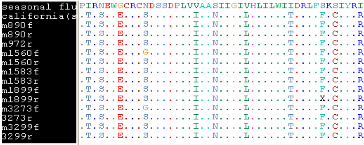
Fig. 4. 2009 pandemic influenza A amino-acid sequences.