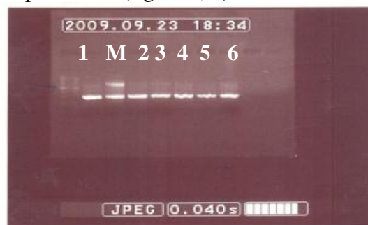
Fig. 1. 2009 pandemic influenza A RT-PCR bonds. Lane M: Ladder and Other Lanes: Samples

We studied 14 isolated of seasonal H1N1 and 7 isolated of 2009 pandemic influenza A viruses; All 21 samples included in this study were positive in RT-PCR assay of M2 gene amplification (figure 1, 2).