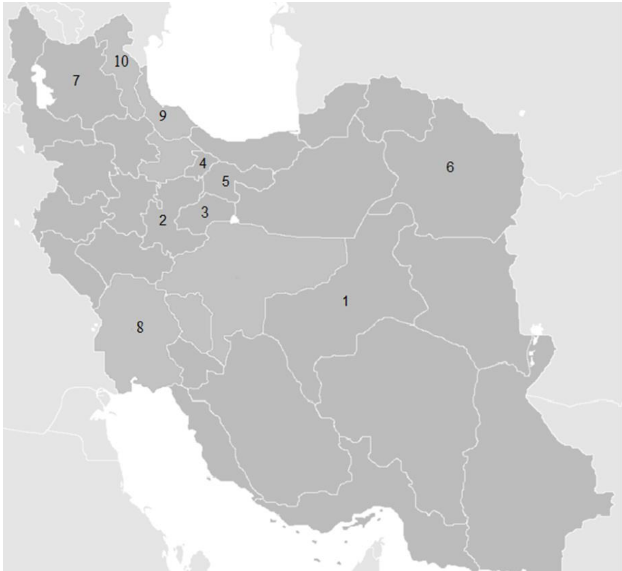
Fig. 1. Location of different areas of Iran considered in this study: (1) Yazd (0%); (2) Markazi (53.3%); (3) Qom (57%); (4) Alborz (45%); (5) Tehran (88.8%); (6) Razavi Khorasan (2.3%); (7) East Azerbaijan (50%); (8) Khuzestan (0%); (9) Gilan (100%); (10) Ardabil (9.5%).