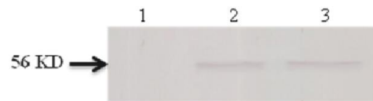
Fig. 2. Western blotting with monoclonal antibodies against the virus nucleoproteins. Lane 1: marker, lane 2: nucleoproteins extracted from MDCK. Lane 3: the extracted nucleoprotein from embryonated chicken egg.