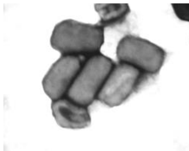
Fig. 1. TEM Electron micrographes of occlusion bodies (OBs) of CpGV and the nucleocapsid inside granulin, stained with PTA 2% aqueous, (Original, X12,000).

the acceptance of the similarity of the lines, the LC50 was nearly half of others and 0.6 of the Mexican isolate, however, that was not significant. The calculated LC50 value for the Mexican isolate in the present experiment was 2724 OB/ml, comparable with 2600 OB/ml (7). The slopes of probit lines were promising and had no significant difference, but the similarity hypothesis of probit lines rejected. However, considerable differences in the virulence and biological activity of the isolates of the CpGV isolates for neonate C. pomonella larvae were found (Table 1) is hopefulness.